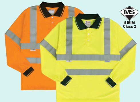
TS2BS - L

Two reflective band around body & one reflective band on sleeves