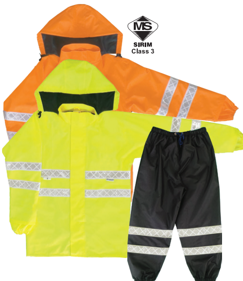
RJ2B & RP2B

Two reflective band over shoulders & around sleeves, one reflective band around body & on pants leg