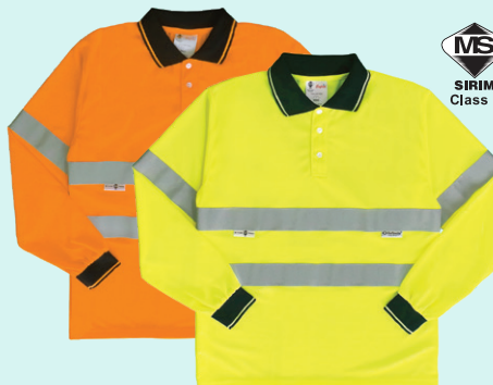
TS2B - L

Two reflective band over shoulders, one reflective band around body & one reflective band on sleeves