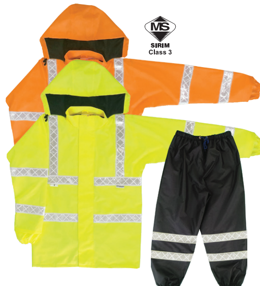
RJ2BS & RP2B

Two reflective band around body & around sleeves. Two reflective band on pants leg