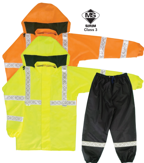
RJ1BS & RP1B

PU coated polyester, seam-sealed, back ventilation, elastic cuffs, double flap zip & velcro fastening, foldable hood and concealed with velcro. Black pant with elastic drawstring at waist & elastic bottom.